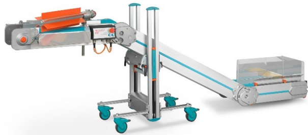
Model: Conveyor with paddle separator (N-CPST)

Dramatically reduce labour intervention with MB Conveyors, offering multi and bespoke solutions.