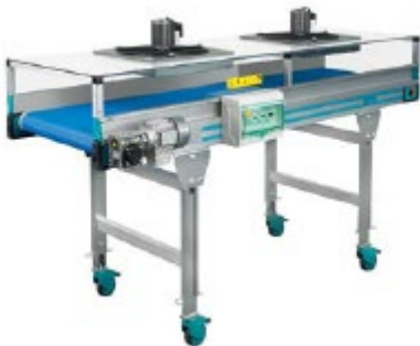
Model: Bespoke cooling Flat conveyor