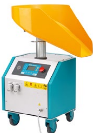
Model: Duck Dispenser