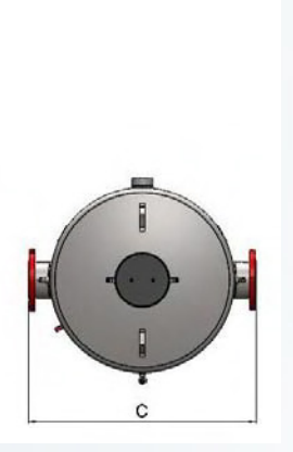
w/out internal septum