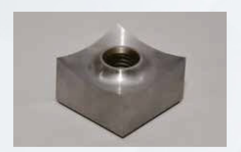
The shredders use concave ground square knives, producing high quality output. The cutters can be turned after a side is worn out.