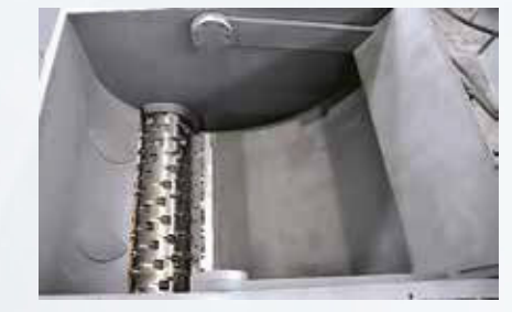
The internal ram design on the ZIS series allows the cutting chamber volume to be increased while keeping a small footprint. Making the ZIS ideal for shredding of big volume parts.