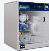
Sound-proofed three-lobe Pump