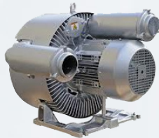
Two side-channel Pump