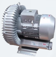
One side-channel Pump