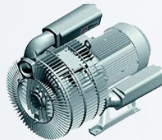
Three side-channel Pump