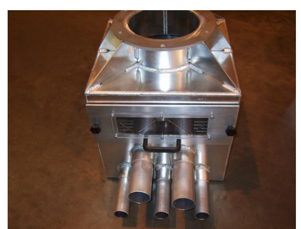
Silo suction box with angel hair drawer built in