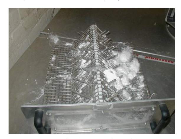
Drawer removed with captured angel hair