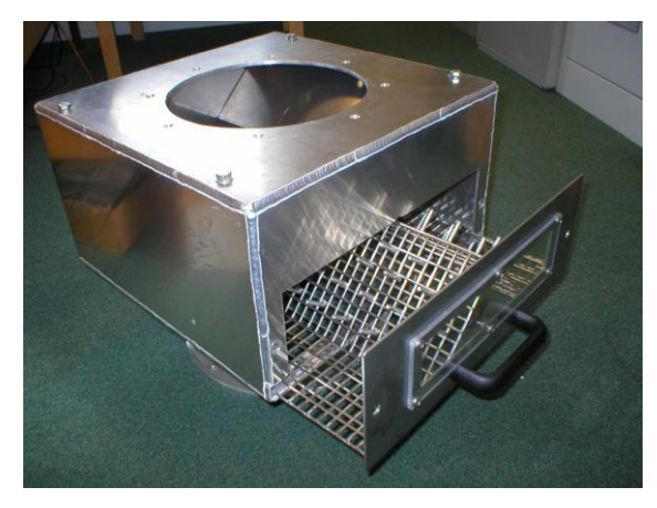
Day bin box with drawer in open position