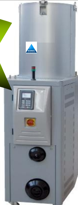
Model: DWC with hopper on load

Over 40% Energy savings with just over 0.025kW per Kg